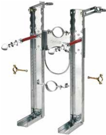
Fig. 1. Example of anchoring system of wall-mounted sanitary fixtures

These articles are typically supplied with the materials necessary to anchor the frame in 4 points: