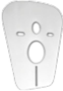
Fig. 2. Noise reduction gasket